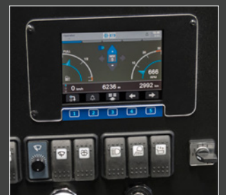
Accurate instrumentation and controls provide a safe and highly realistic training environment