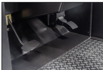
Full pedal base controls