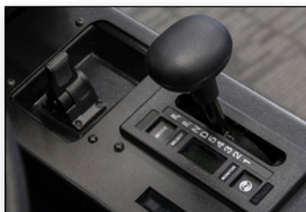
Gear and dump controls