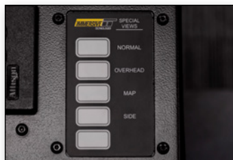
Multiple camera views