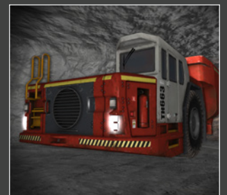
Machine dynamics faithfully reproduced to give maximum realism

With mining equipment becoming increasingly technically sophisticated, the level of information, experience and organizational competencies required to accurately simulate these machines also increases. Through Immersive Technologies' industry experience, you can be assured your training solution will be the only accurate and true representation of the real machine available.