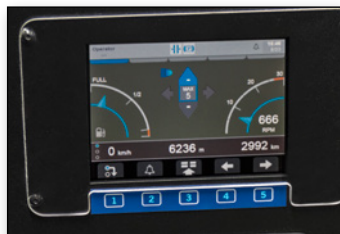
Accurate vehicle display module