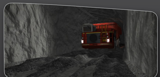
Safe Operating Procedures