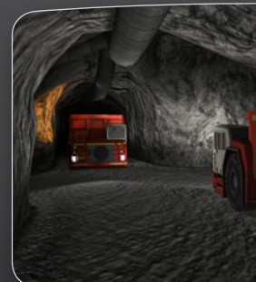
Site Specific Procedures