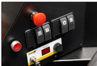
Radio and emergency functions