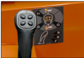
Pivoting steering lever