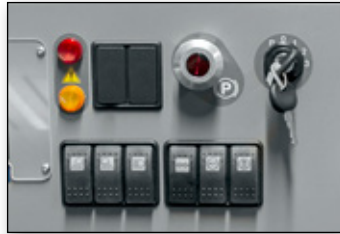
Complete replicated controls