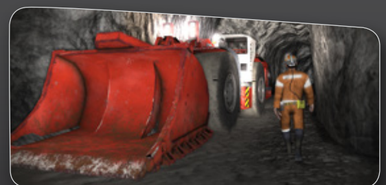
Safe Operating Procedures