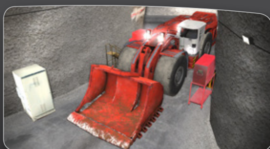
Startup / Shutdown Procedures