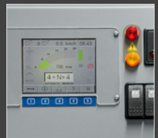
Accurate instrumentation and controls provide a safe and highly realistic training environment