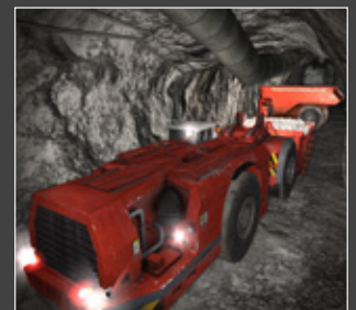
Machine dynamics faithfully reproduced to give maximum realism

With mining equipment becoming increasingly technically sophisticated, the level of information, experience and organizational competencies required to accurately simulate these machines also increases. Through Immersive Technologies' industry experience, you can be assured your training solution will be the only accurate and true representation of the real machine available.