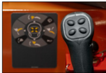
Boom and bucket controls