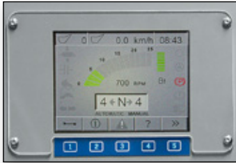
Vehicle display screen