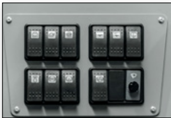
High fidelity vehicle controls