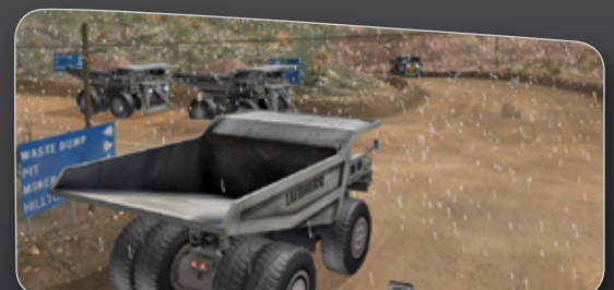
Safe Operating Procedures