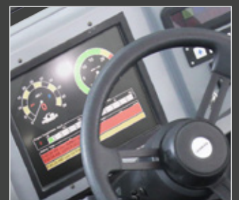
Conversion Kit utilizes genuine Liebherr cab controls and instrumentation