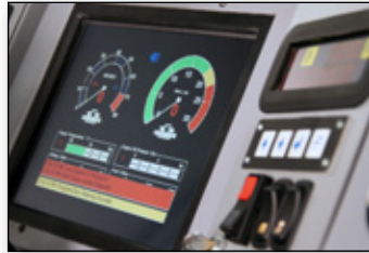
Genuine Liebherr steering wheel, LCD monitor console and switch/indicator panel