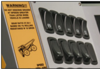
Functional lighting, brake, lube and fault reset switch panel