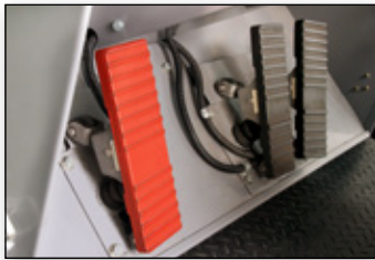
Accelerator, retarder and emergency brake pedals match real machine cab layout