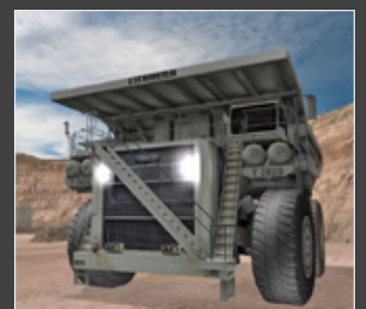
Accurate operational characteristics using technology and proprietary data licensed from Liebherr

Original Equipment Manufacturer and industry endorsed T282B operating procedures are tightly integrated with an extensive learning system within the Advanced Equipment Simulators. This system has been repeatedly demonstrated via evidence collected from within mining operations to provide rapid, correct and effective learning and assessment.