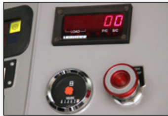
Payload, suspension and fault code display, hour meter and emergency shutdown switch