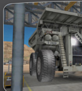
Site Specific Procedure