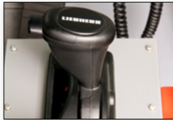
Genuine Liebherr shift selector