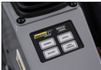
Special View Switches