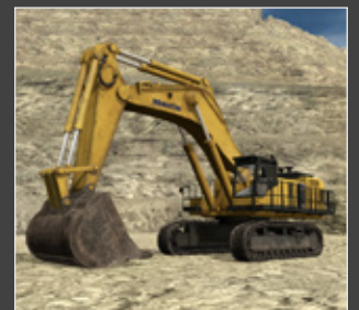
Accurate operational characteristics using technology and proprietary data licensed from Komatsu

With mining equipment becoming increasingly technically sophisticated, the level of information, experience and organizational competencies required to accurately simulate these machines also increases. Through Immersive Technologies' industry experience and exclusive alliance with Komatsu, you can be assured your training solution will be the only accurate and true representation of the real machine available.