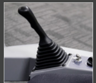
Conversion Kits utilize genuine Komatsu cab controls and instrumentation