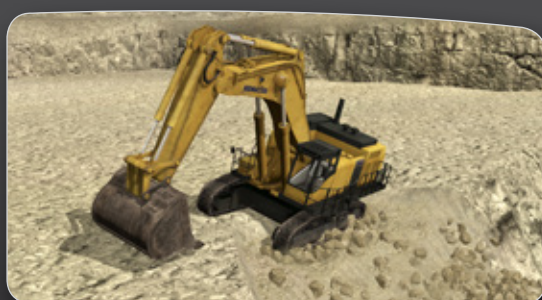
Safe Operating Procedures