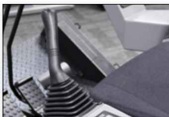
Left Hand Joystick