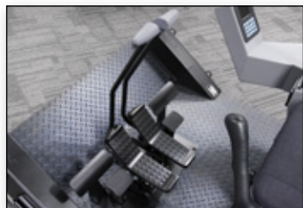
Left and Right Propel Pedals