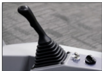
Right Hand Joystick