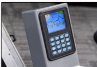
Vehicle Monitoring Screen and Keypad

These include an operational Vehicle Health Monitoring System, a powerful tool for machine management that provides operators with information on a wide range of vital machine functions, display unit keypad, dual axis control joysticks and pedals.