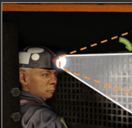
RealView™ natural movement system allows training for hazard identification behind obstructions.