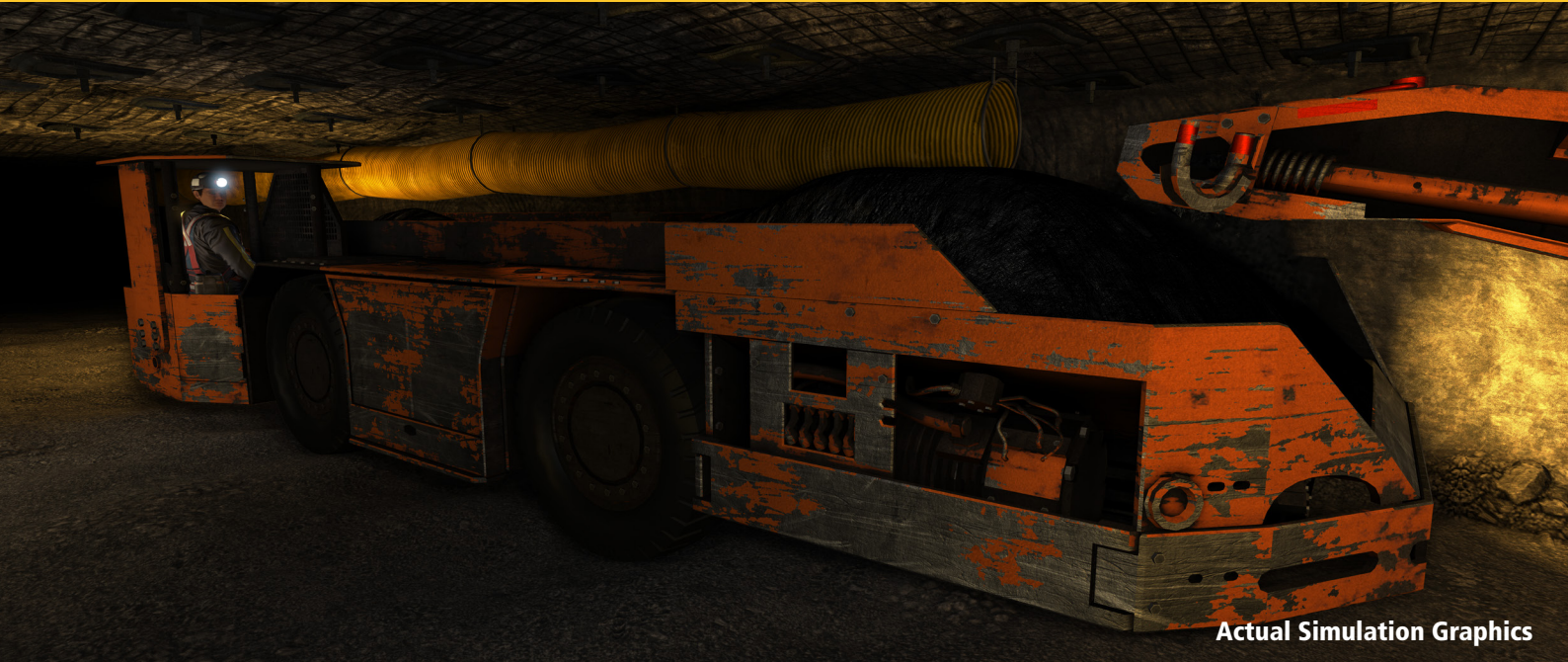
Actual Simulation Graphics