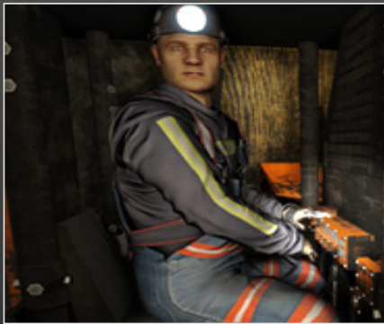
Machine controls faithfully reproduced to give the maximum realism