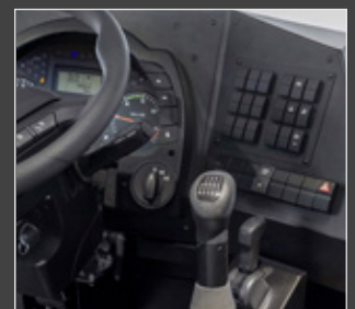
Accurate instrumentation and controls provide a safe and highly realistic training environment