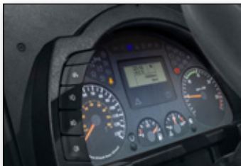
Fully functional in-dash display

The Conversion Kit includes a complete replica cab of the Iveco Trakker AD 380 T42 WH Light Truck, with fully functional controls and instrumentation sourced directly from OEM. These include genuine Steering Wheel, in-dash display providing information to operators on a wide range of vital machine functions. Additionally the Conversion Kit features OEM pedals, manual transmission gear selector and hoist control lever.