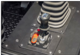
Genuine hoist lever