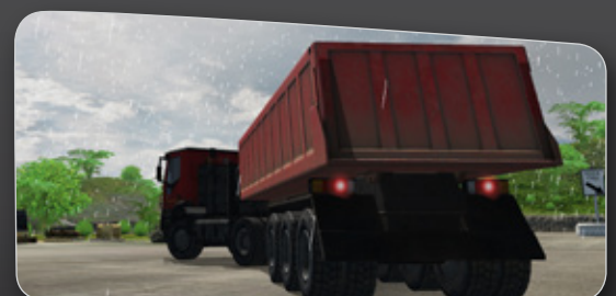
Safe Operating Procedures