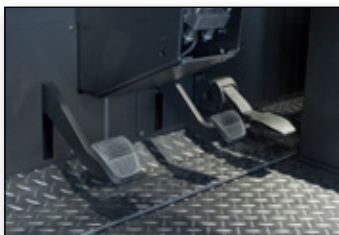
Throttle, brake and clutch pedals matching OEM machine