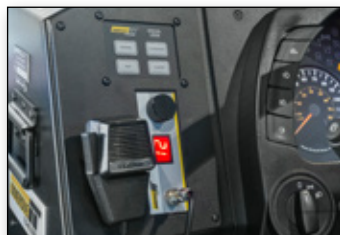
Simulated radio module and special view controls