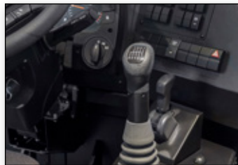
Genuine transmission gear selector