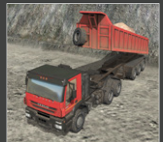
Machine dynamics faithfully reproduced to give maximum realism

With mining equipment becoming increasingly technically sophisticated, the level of information, experience and organizational competencies required to accurately simulate these machines also increases. Through Immersive Technologies' industry experience, you can be assured your training solution will be the only accurate and true representation of the real machine available.