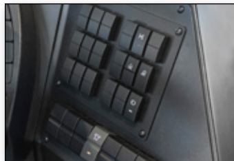
Genuine control switches