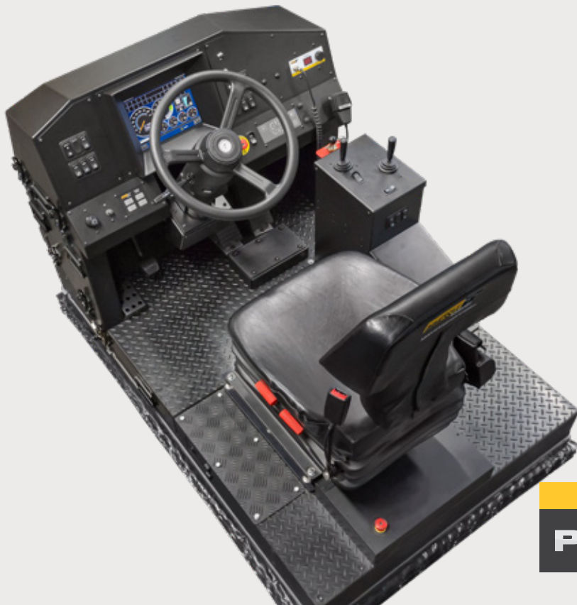
Fully functional in dash screen