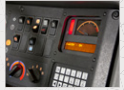
Transmission control, park brake and fire extinguisher