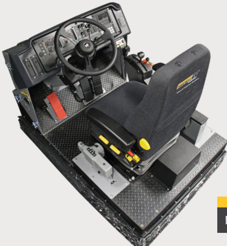
Caterpillar Vital Information Management System and instrument panel