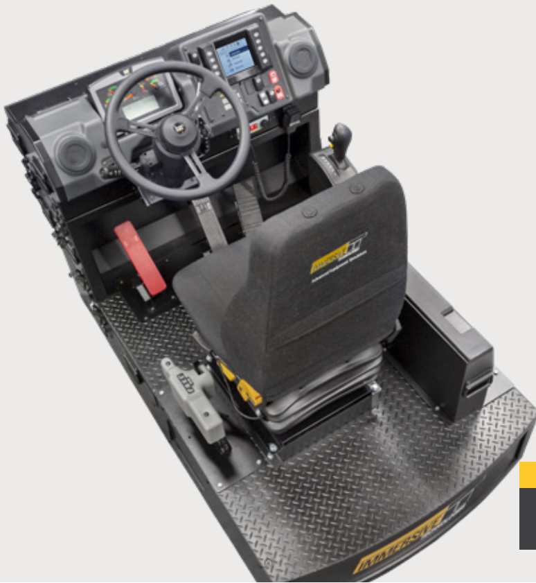
Simulated Caterpillar® Advisor.