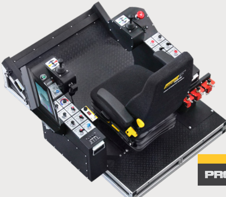
Bucyrus Operator Display