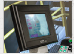
Fully functional controls and instrumentation