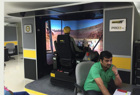
As part of the implementation Training Consultants from Immersive Technologies delivered Training Systems Integration (TSI) including the development of site specific training syllabus, curriculum and lesson plans.